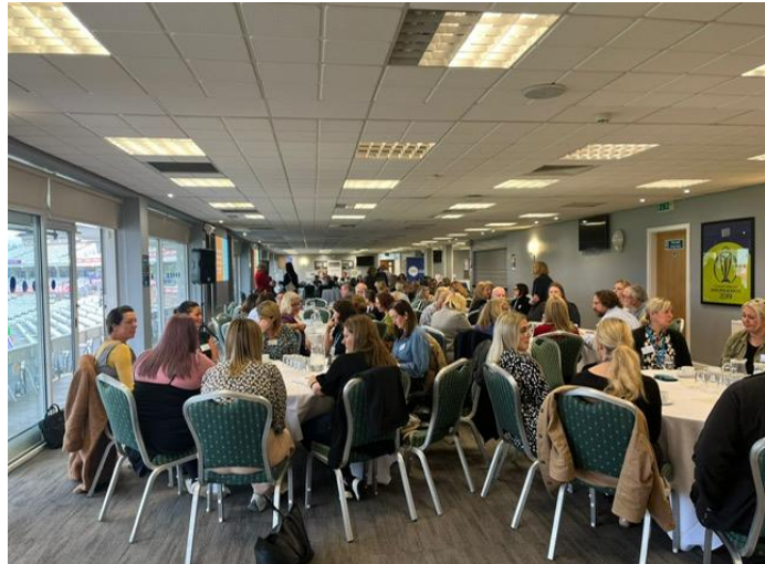
Delegates at the Universal Credit Migration conference