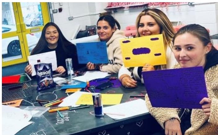
Learning business planning skills