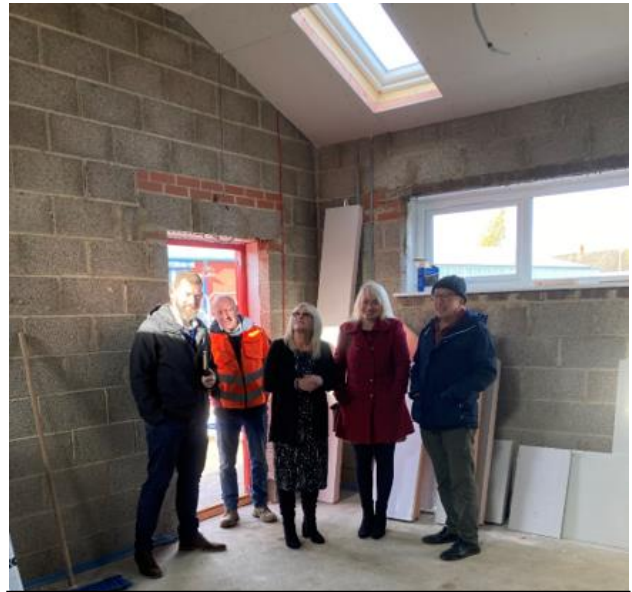
Checking in on the new extension at Woodhouse Close Church and Community Centre

53 The extension will enable existing space/rooms to be reconfigured i.e., a small break out room for 1-1 meetings will be created, the vestry will be increased in size for much needed office space as well as additional meeting area space.