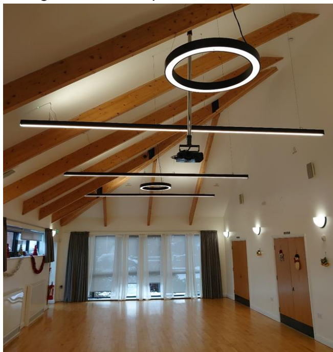
The new energy efficient LED lighting scheme