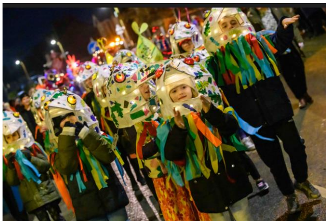
Children enjoying Crook Winter Light Parade