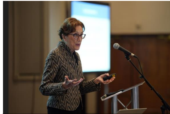
Dame Carol Black speaking at the County Durham Partnership Annual Event

25 Our keynote speaker was Professor Dame Carol Black, the Government's independent advisor on drug misuse, Chair of the British Library, the Centre for Ageing Better and Think Ahead, the Government's fast-stream training programme for Mental Health Social Workers. Carol's work around drug treatment provides a positive example of working as a whole system to address health inequalities and was well received alongside contributions on the new Joint Local Health and Wellbeing Strategy and the County Durham Together approach.